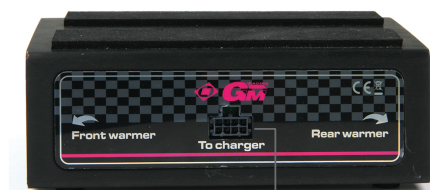
• Charging connector