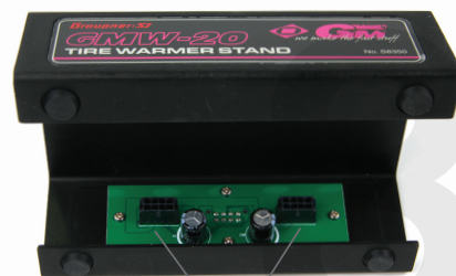
• Warmer connector